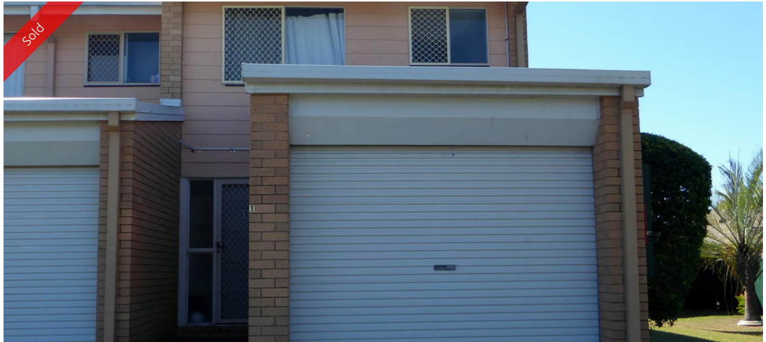
Unit 1, 1516 Anzac Ave, Kallangur