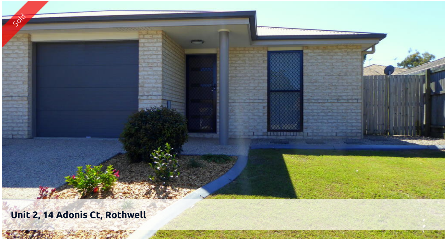
Unit 2, 14 Adonis Ct, Rothwell